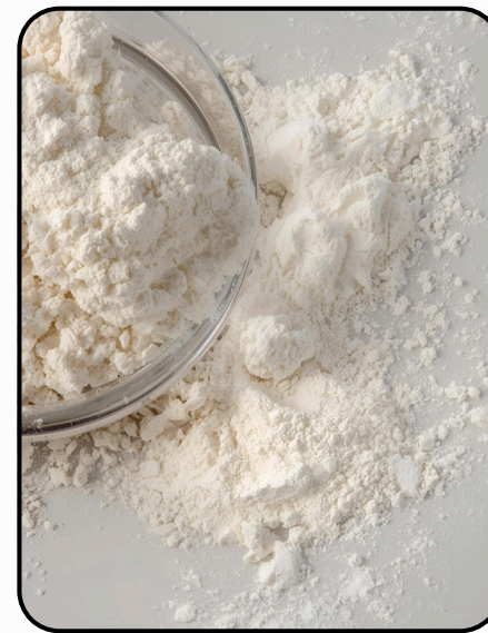
Silica / Quartz